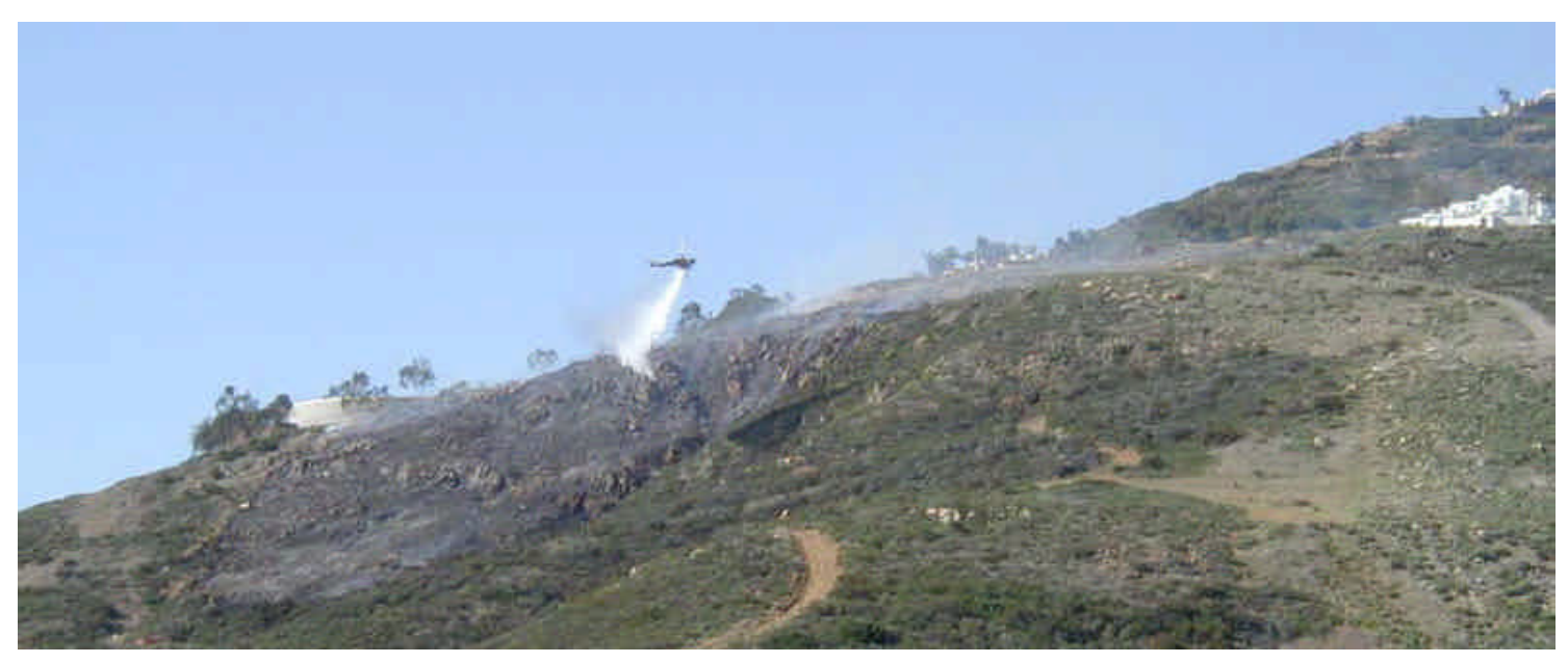
California Department of Forestry helicopter fights Paint Mountain Fire